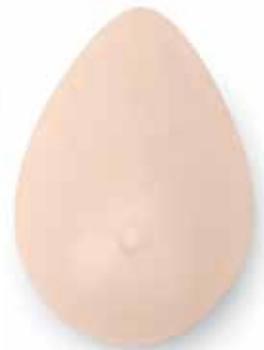
473 SILK TEARDROP

The innovative silky-soft skin offers unparalleled softness and suppleness.