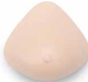
471 SILK TRIANGLE